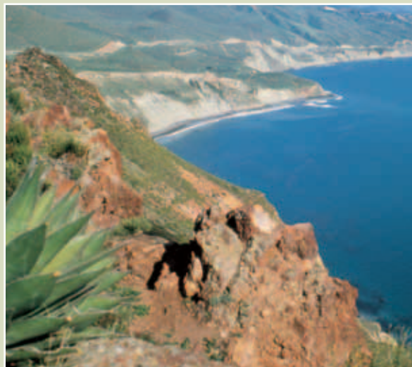
EXHIBIT AND SUPPORT OPPORTUNITIES

For information on the many exhibit and sponsor opportunities during any Scripps educational conference, please contact: Scripps Conference Services & CME at 858-652-5400 or med.edu@scripps.org . www.scripps.org/conferenceservices