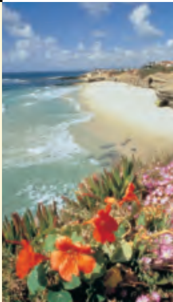
Exhibit and Support Opportunities

La Jolla is known throughout the world for its beautiful beaches and year-round temperate weather. Nestled on the northern edge of San Diego, it is unique in that it maintains its quaint village atmosphere within a sophisticated cosmopolitan environment. A broad spectrum of cultural and recreational activities is also available in the metropolitan San Diego area, including the nationally acclaimed San Diego Zoo, Wild Animal Park, Sea World, the San Diego Opera, the Old Globe Theater, and the Museum of Contemporary Art, San Diego in La Jolla.