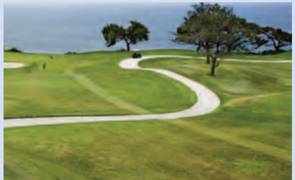
Exhibit and Support Opportunities

For information on the many exhibit and support opportunities during any Scripps educational conference, please contact Scripps Conference Services & CME at 858-652-5400 or med.edu@scrippshealth.org .