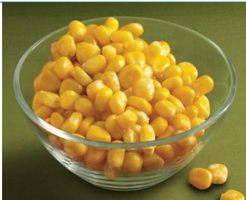
½ cup of corn