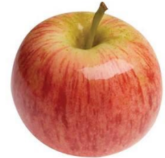
One small apple