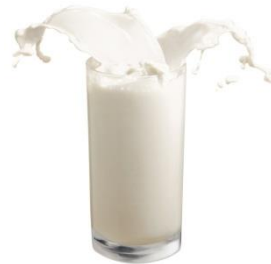
Eight ounces of milk