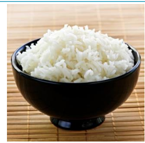
1/3 cup of rice or noodles