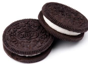
Two cookies (i.e. Oreos)