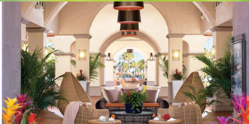
Exhibit & Support Opportunities

Make your reservations early! A block of rooms is being held for us until January 9, 2013. After this date, reservations will be accepted on a space and rate availability basis only. Be sure to mention the Scripps Natural Supplements Conference reduced rate of $209. (excluding tax) when making your reservations.